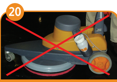
Do not store machine with