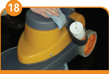
Wipe machine clean with a damp cloth.