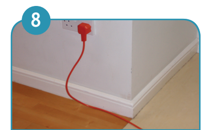
Keep cable flat on the floor, NOT taut.