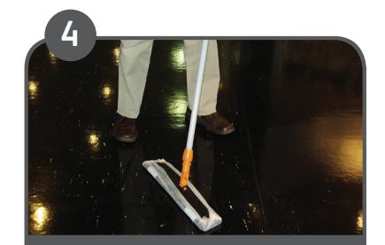
Dust control floor area with mop sweeper.