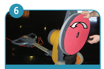
Tip machine back to put handle on floor and fit pad. Turn pad retainer anticlockwise to lock on.