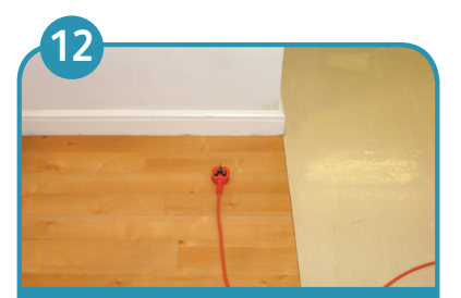
Check pad/brush regularly for clogging. Unplug and turn/ change as required.