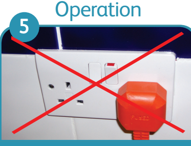
Do not plug in and switch on at socket until machine is ready for use.