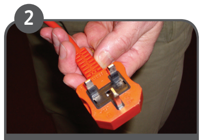
Check equipment, especially plug and cable. Report any fault or damage to a supervisor. Label as faulty and do not use.