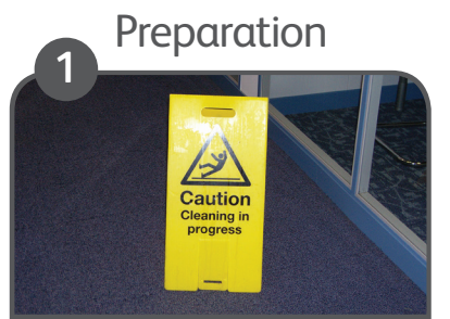
Display warning signs.