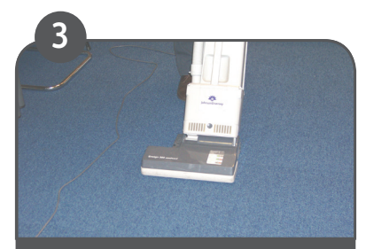
Thoroughly vacuum the carpet.