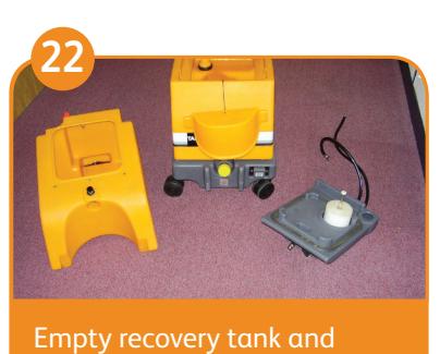
clean (tank may be removed)