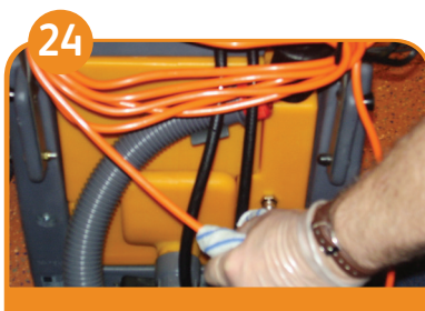
Wind cable back round handle, wiping clean with damp cloth and checking as you do.