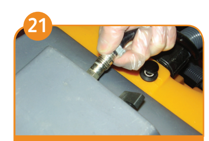
Switch off vacuum and detach hoses ensuring no dirty water escapes from the extraction hose.