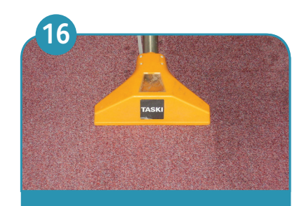
If necessary, pass over same path again without squeezing the trigger to ensure maximum water removal.