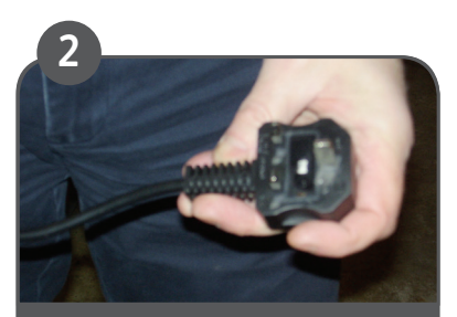
Check equipment, especially plug and cable. Report any fault or damage to a supervisor.