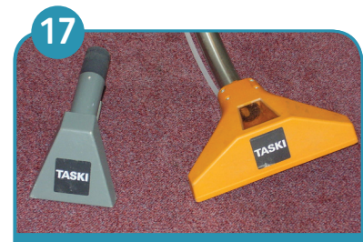
For stairs, edges, corners and upholstery replace wand with had nozzle.