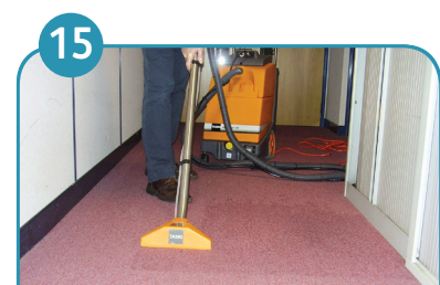
Heavily soiled carpets may require more than one pass.