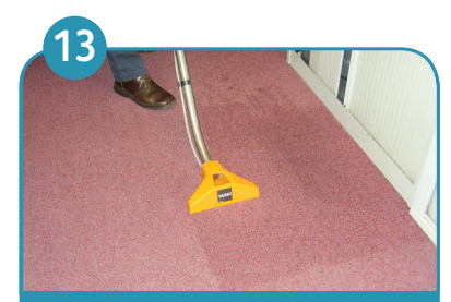
At end of pass release trigger and continue backwards for a few inches to recover last drops of water.