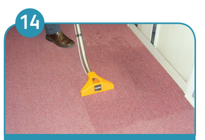
Work in overlapping passes to ensure carpet is cleaned thoroughly and evenly.