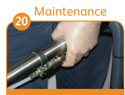
Switch off pump and operate trigger to release pressure.