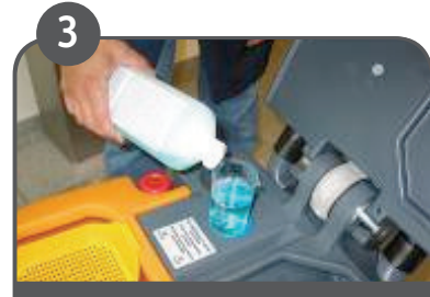
Dose cleaning product into dosing aid and pour into the grey fresh water tank.