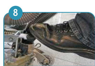
Lower squeegee by pushing down the foot pedal.