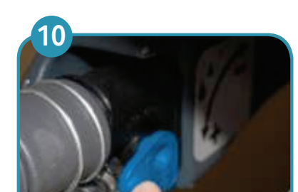
Adjust solution flow with the light blue lever on the left side of the machine.