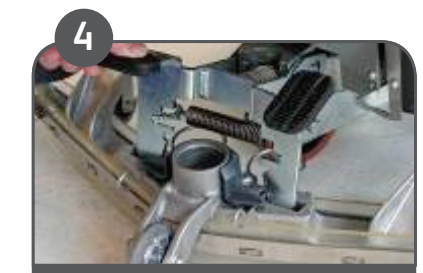
Mount squeegee: position pockets of the squeegee exactly under the squeegee holder and push holder down.