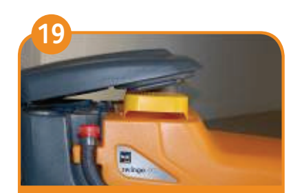
Flip the yellow dirt sieve and store the machine with partially open lid for ventilation (lid rests on the yellow dirt sieve).