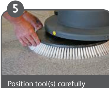
Position tool(s) carefully under lifted brush unit.