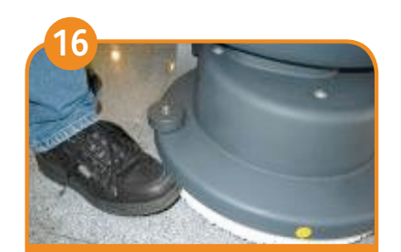
by turning anti-clock-wise, clean tools and allow to air dry.