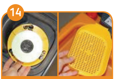
Clean the floater and the yellow dirt sieve.