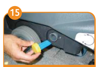
Clean solution filter.