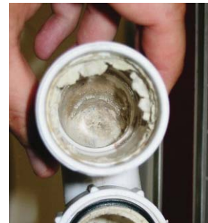
The same pipe-work after 6 months using Biological Toilet Blocks Bio Blocks®