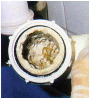
The pipe-work whilst using PDCB BLOCKS

Before switching to Bio Blocks, the contractor charges for unblocking pipes ran into several hundred pounds. The results of the trial showed that Bio Blocks were able to keep the urinals clean and the pipe-work clear of any blockages providing substantial savings to the customer.